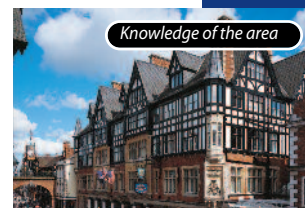
Knowledge of the area

Why not give us a call soon and discuss how we can increase your future business levels.