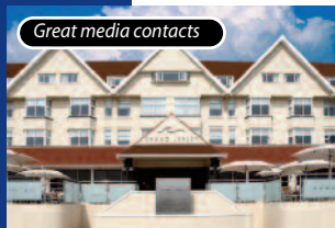
Great media contacts