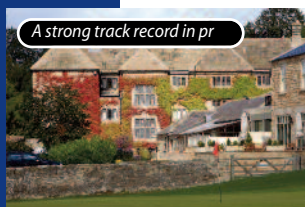
A strong track record in pr