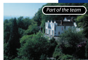
Part of the team

"I think the hotel is very wise to rely on your northern-based agency with a proven track record, and one providing a top quality, personalised service" Leading freelance travel writer